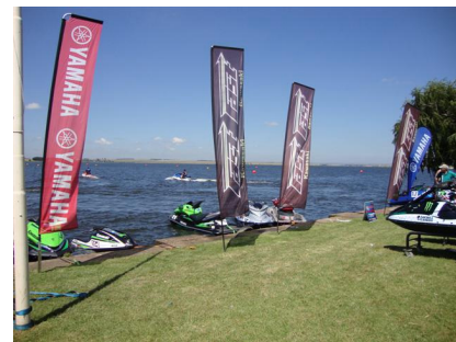
Above & below: Images from the 1 st Jetsport National Tour